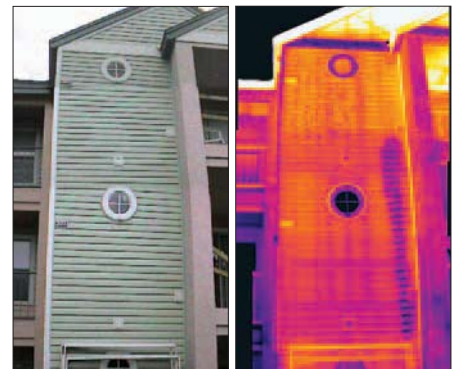
The thermogram of this vinyl-sided 3-floor apartment building clearly shows the path of a serious leak, completely hidden within the wall, from a washing machine on the third floor.

Instantly image entire rooms, inspect places that can't be physically reached with moisture meters, reveal wet conditions behind surfaces such as enameled walls and wallpaper that don't readily water stain, track leaks to their source, monitor the drying process, and confirm when a structure is dry.